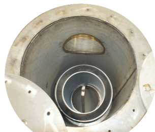
Filter Element inside of Housing without Cover